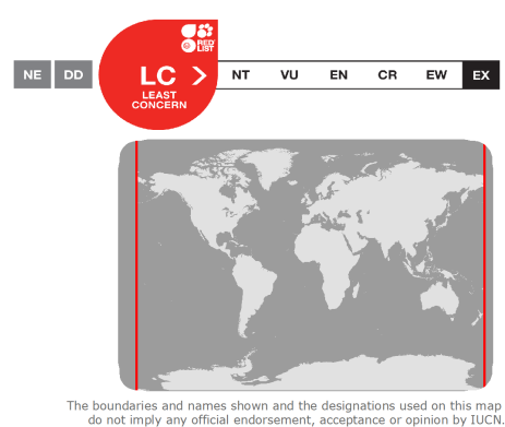
The boundaries and names so do not imply any official

IUCN Grouper and Wrasse Specialist Group